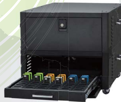
60-slot charger drawer