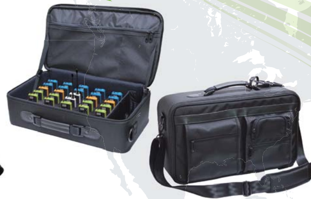
35-slot charger carry case