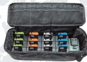
12-slot charger hand bag