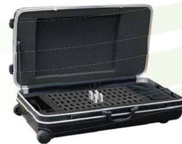
70-slot charger trolley