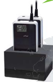
2-slot desk charger